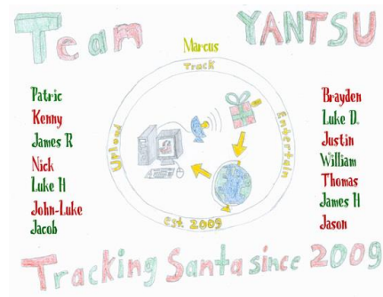
The 2013 Team YANTSU Logo

The Arctic webcams have been picked up by a Russian ship for 2013 and images will not be available until next year.